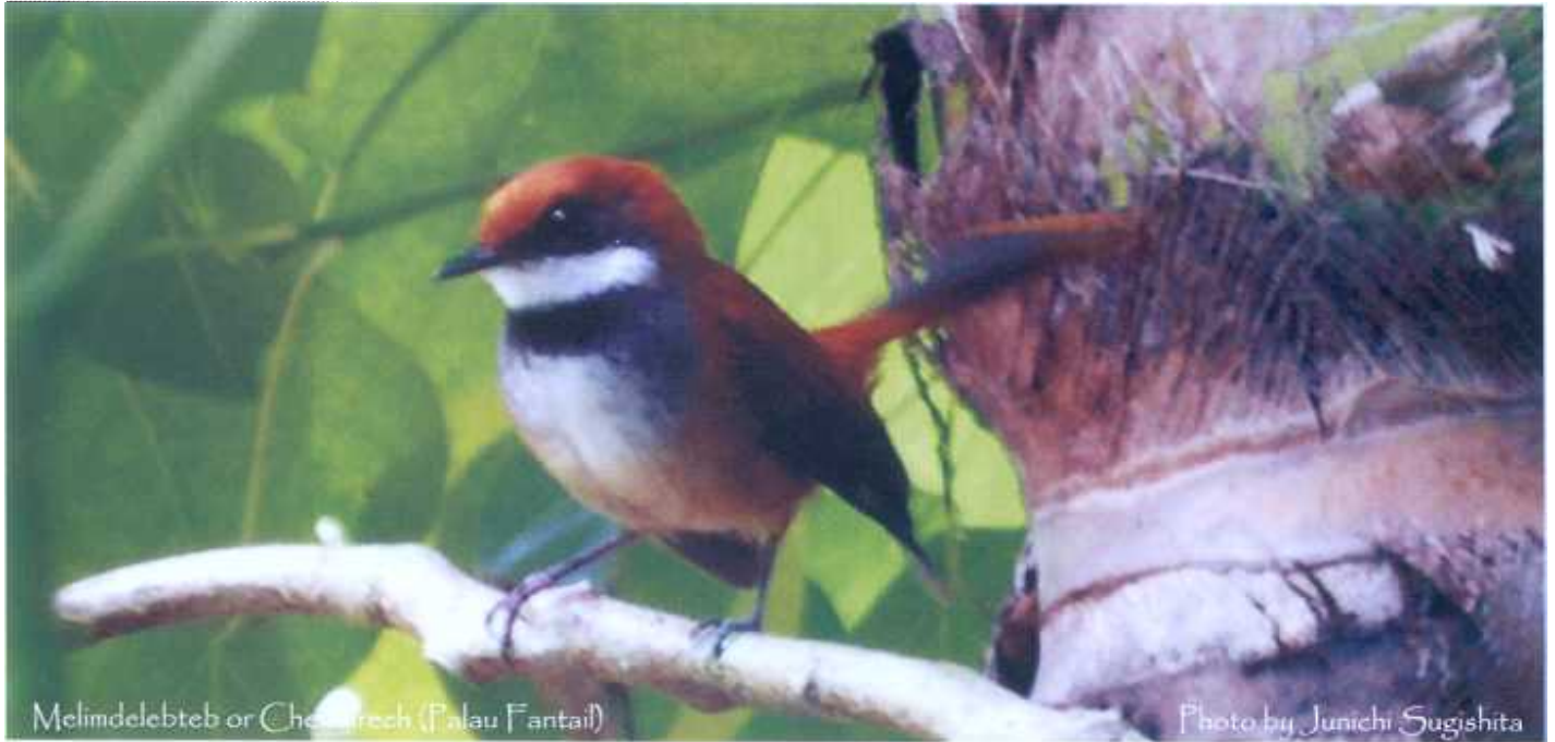
Melimdelebleb or Chelchirech (Palau Fantail)